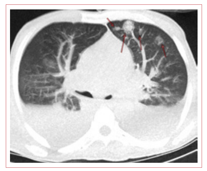
Figure 1. Axial CT scan in the parenchymal window showing multiple nodular lesions (arrows) with peripheral ground glass density.

However, a thoracic CT revealed pneumonia in the right