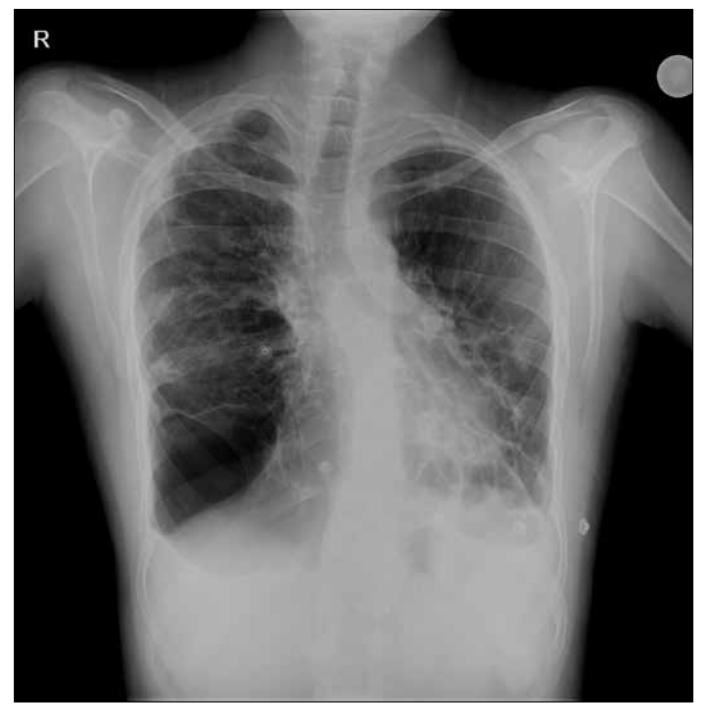
Figure 3. Chest X-ray after discharge from the ICU. Total recovery of pulmonary edema. ICU: intensive care unit

This young adult presented with acute respiratory distress after catheterization, accompanied with hypoxemia, hypercarbia, tachycardia, neutrophil-predominant hyperleukocytosis, and bilateral diffuse intensity on chest X-ray (Figure 2). He was diagnosed with acute mixed-type respiratory failure secondary to NCPE. The patient was admitted to the intensive care unit (ICU) and supported by non-invasive mechanical ventilation (BIPAP-ST 15/5 cm H<sub>2</sub>O) bronchodilator and oxygen treat-