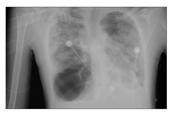
Figure 2. Chest X-ray after the procedure. A newly developed bilateral diffuse infiltration.

On physical examination, results were BP: 135/86 mmHg, HR: 186/tachypnea (46 breaths/min) regular, body temperature: 36.9°C, and oxygen saturation: 81% (6 l/min with nasal cannula). Cyanosis, subcutaneous emphysema, or jugular filling was not observed. Heart examination was normal except for tachycardia. Fine crackles were bilaterally heard over the basal lung areas.